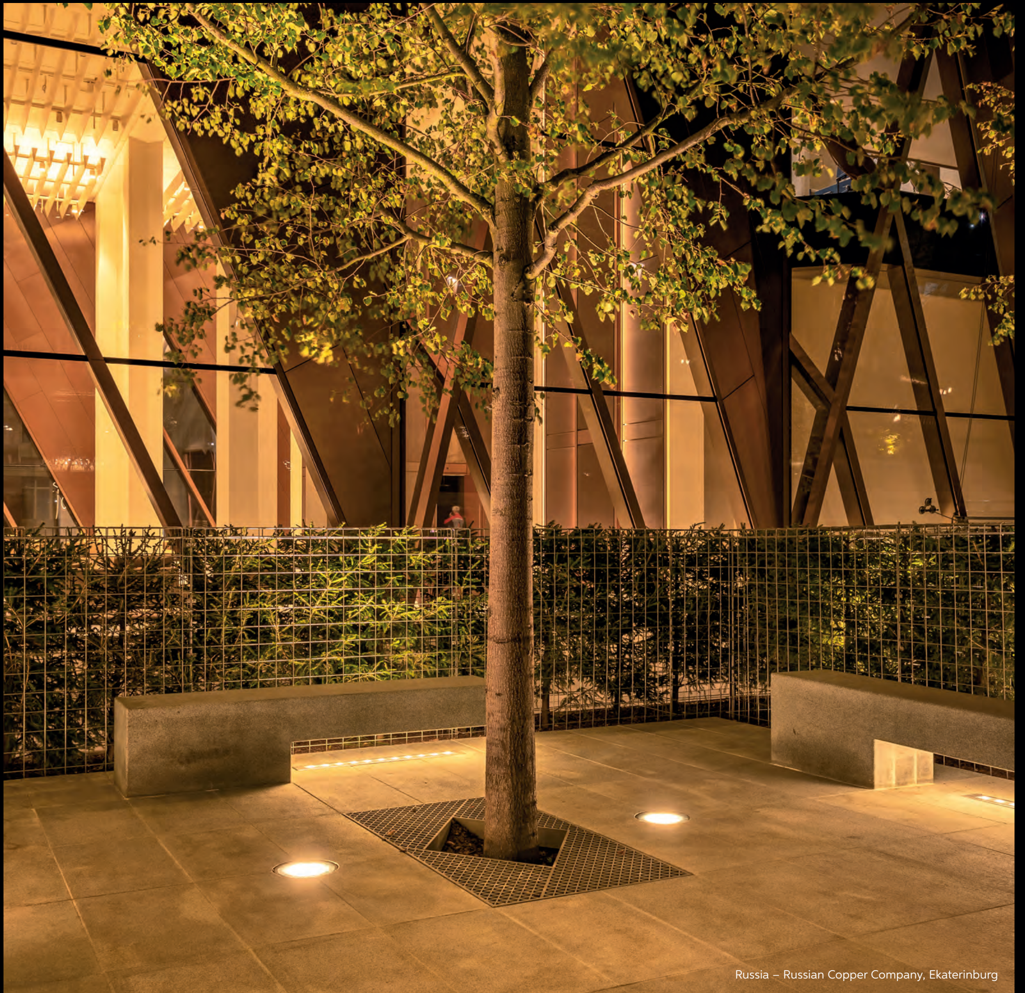
Russia – Russian Copper Company, Ekaterinburg